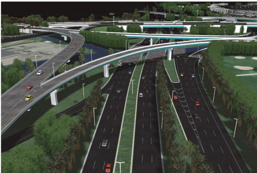
Le Jeune Road South with MIA and MIC Access Ramps

McCranie & Associates' staff designed and prepared plan and profile drawings for the entire roadway project. The Interconnector is a 6.2-kilometer expressway connection between SR 836 south of Miami International Airport and the terminus of SR 112 north of Miami International Airport (MIA). There are three multi-level interchanges. Interchanges on the interconnector occur at SR 836, Central Boulevard and at SR 112. The Central Boulevard interchange will provide access between MIA and the Interconnector and has involved significant coordination with the Dade County Aviation Department. Also, designed and prepared the hydraulic report for the entire MIC project.